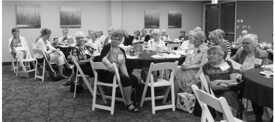
Alumnae listen to the luncheon presentations.