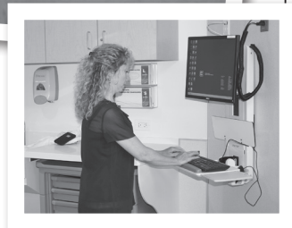
Mounted workstations in each patient room provide more space for patients and staff.