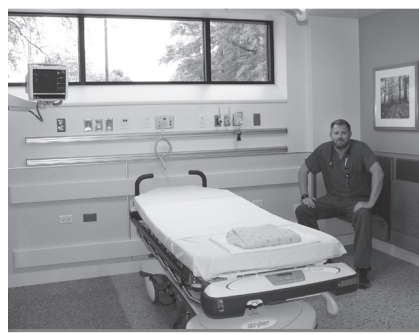
Renovated patient rooms have theater-style seating for visitors.