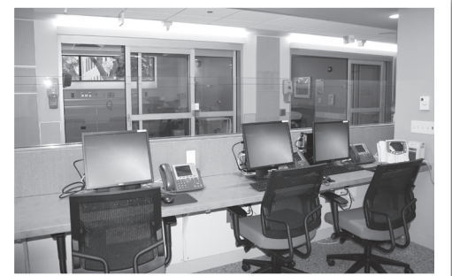
Nursing stations are equipped with ample workstations, and also face patient rooms.