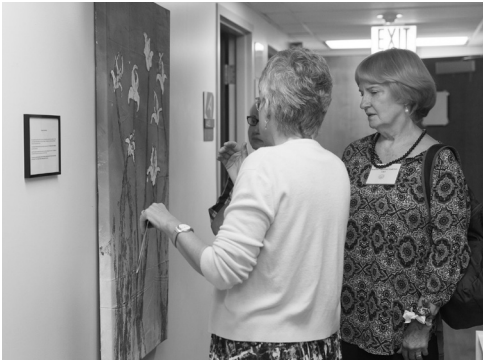
SCHNAA alumnae appreciate patient artwork made through the Healing Arts program during the hospital tour.